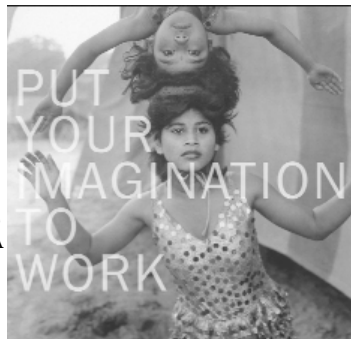
ACCORDS EMPHATICALLY THEIR ACT AT 941 41 8th St in Chicago, August 1989.