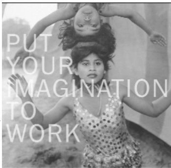
ACCOUNTS EMPHATICALLY THEIR ACT AT 841 41 8th St in Chicago, August 1988